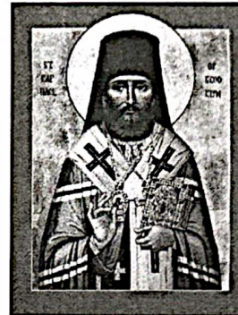
St. Raphael of Brooklyn

Have you ever been to New York City? Did you know we have an American saint from Brooklyn?