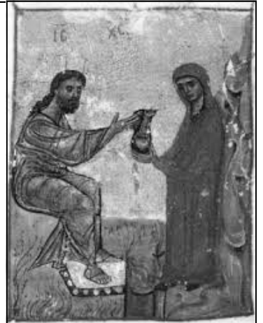
Jesus talking with the Samaritan woman

In today's Gospel reading, we hear about a woman who did some bad things in her life. When she talked with Jesus, she didn't tell him she did something wrong. He just knew it! He already knew all about her. Maybe she thought, "I'm in trouble now!"